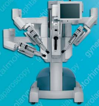
da Vinci Surgical Robot