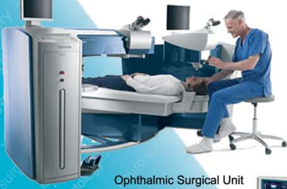
Ophthalmic Surgical Unit

Kit contents: IONYX-SR HD, external power, guide